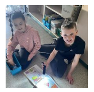
Left photo: Michif Ice Fishing; Center photo: Grade 1 Snowshoeing; Right photo: Flashlight Friday Reading