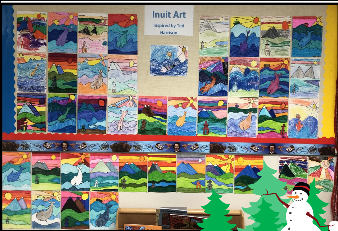
Above: Art pieces recognizing Inuit Day on November 7th.