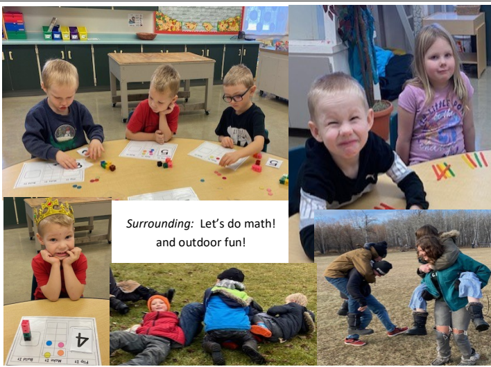
Surrounding: Let's do math! and outdoor fun!