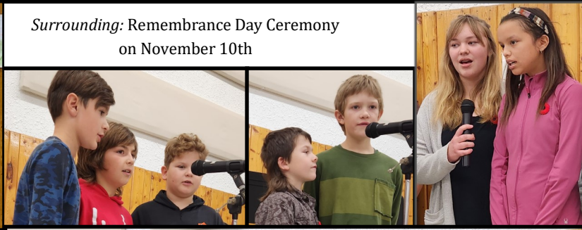
Surrounding: Remembrance Day Ceremony on November 10th