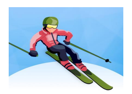
Table Mountain Ski Trip Friday March 15 Buses leave 9:00 am sharp and will return to the school around 5:45 pm for parent pick up