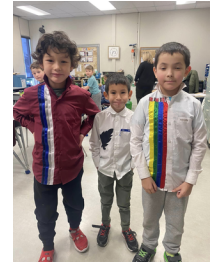
Left photo: Ribbon Skirt Day ; Center photo: $5 or a Can a Month Campaign; Right photo: Ribbon Shirt Day