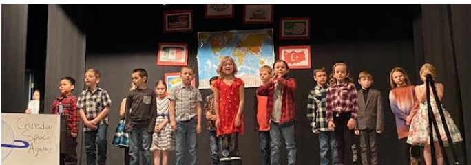
Grade 2/3 class Sings the Twelve Days of Christmas

Neilburg School had an elementary K-6 Christmas concert on Dec. 15 th at 7:00p.m. This year's theme was "Tracking Santa" where students had roles as field reporters, and news anchors that were tracking Santa Claus' current location and progress around the world. They were able to track his progress using their top secret Tracking Santa technology. It was a huge success with the play performed by grade six students and a few grade 4/5's. Each grade prepared a performance for the audience and spent time rehearsing and practicing for weeks for the big night. Roughly 200 people showed up to the Christmas concert. Thank you to the grade 7's who spent time making props and helping backstage. Thank you to all who helped with setting out chairs and making sure everything went smoothly. Thank you to everyone who showed up for the Christmas concert! Merry Christmas!