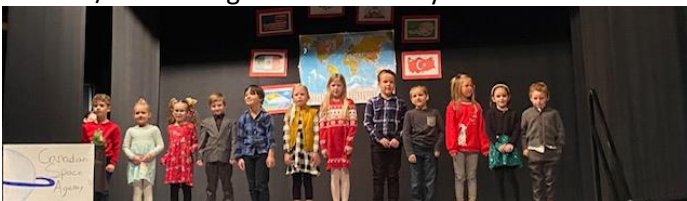
Grade 1 class singing Feliz Navidad