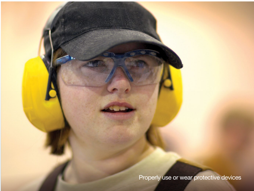
Properly use or wear protective devices

Everyone in the workplace is legally responsible for workplace safety. Before you start a new job, you should know