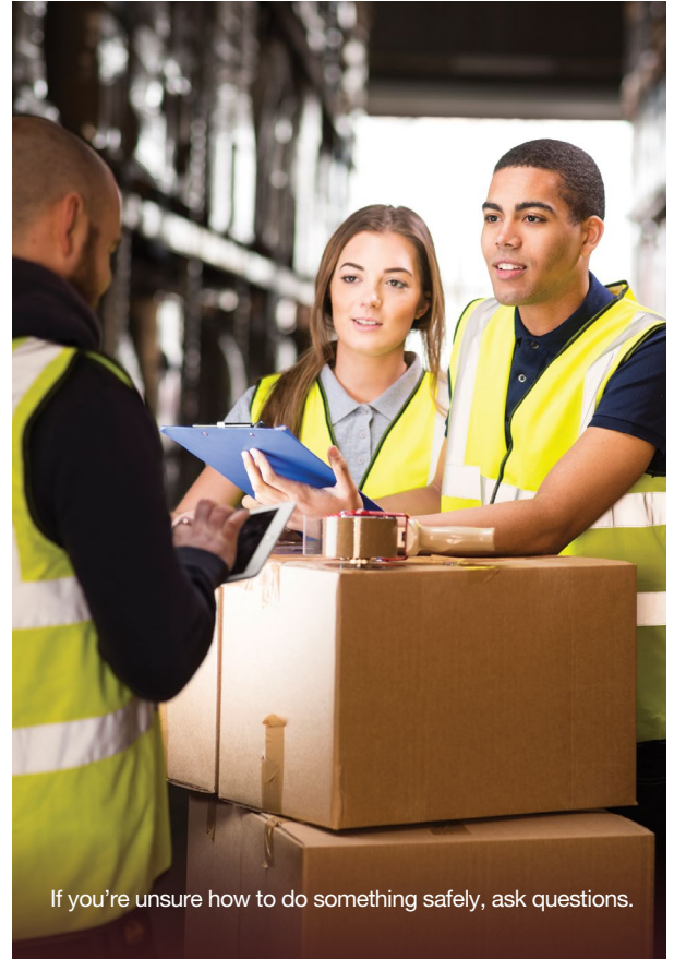
If you're unsure how to do something safely, ask questions.

about health and safety standards in the workplace. By law, you have three basic rights under The Saskatchewan Employment Act :